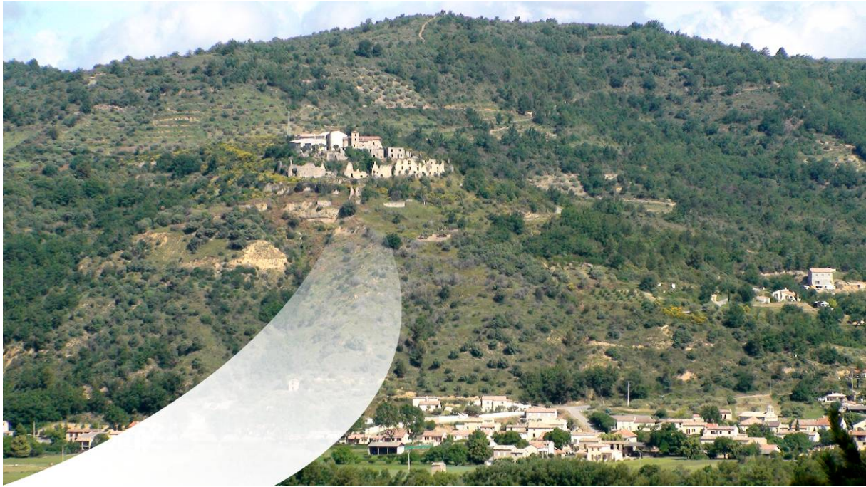
“Le Vieux Bras” village